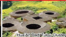
Hua'An Dadi Tulou Cluster