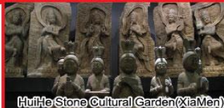
HuiHe Stone Cultural Garden (XiaMen)