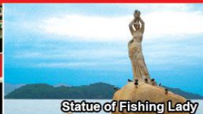
Statue of Fishing Lady