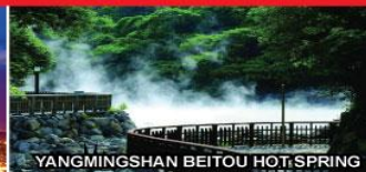
YANGMINGSHAN BEITOU HOT SPRING