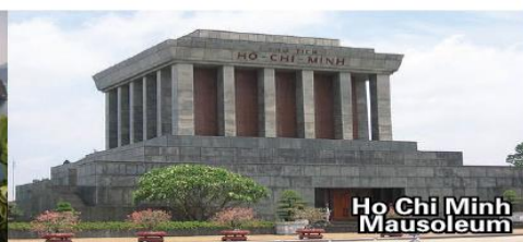
Ho Chi Minh Mausoleum

Sequences of Itinerary are subject to local arrangement.