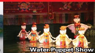
Water Puppet Show