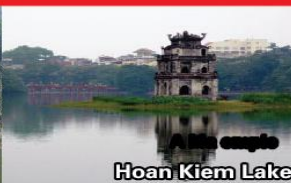
Hoan Kiem Lake