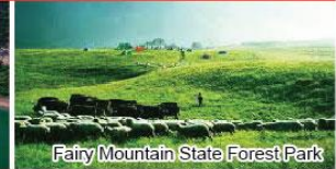
Fairy Mountain State Forest Park